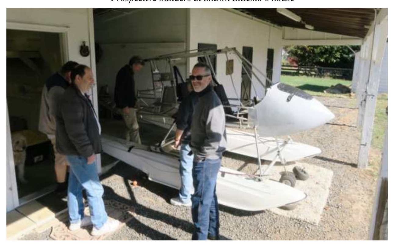
Kicking the tires