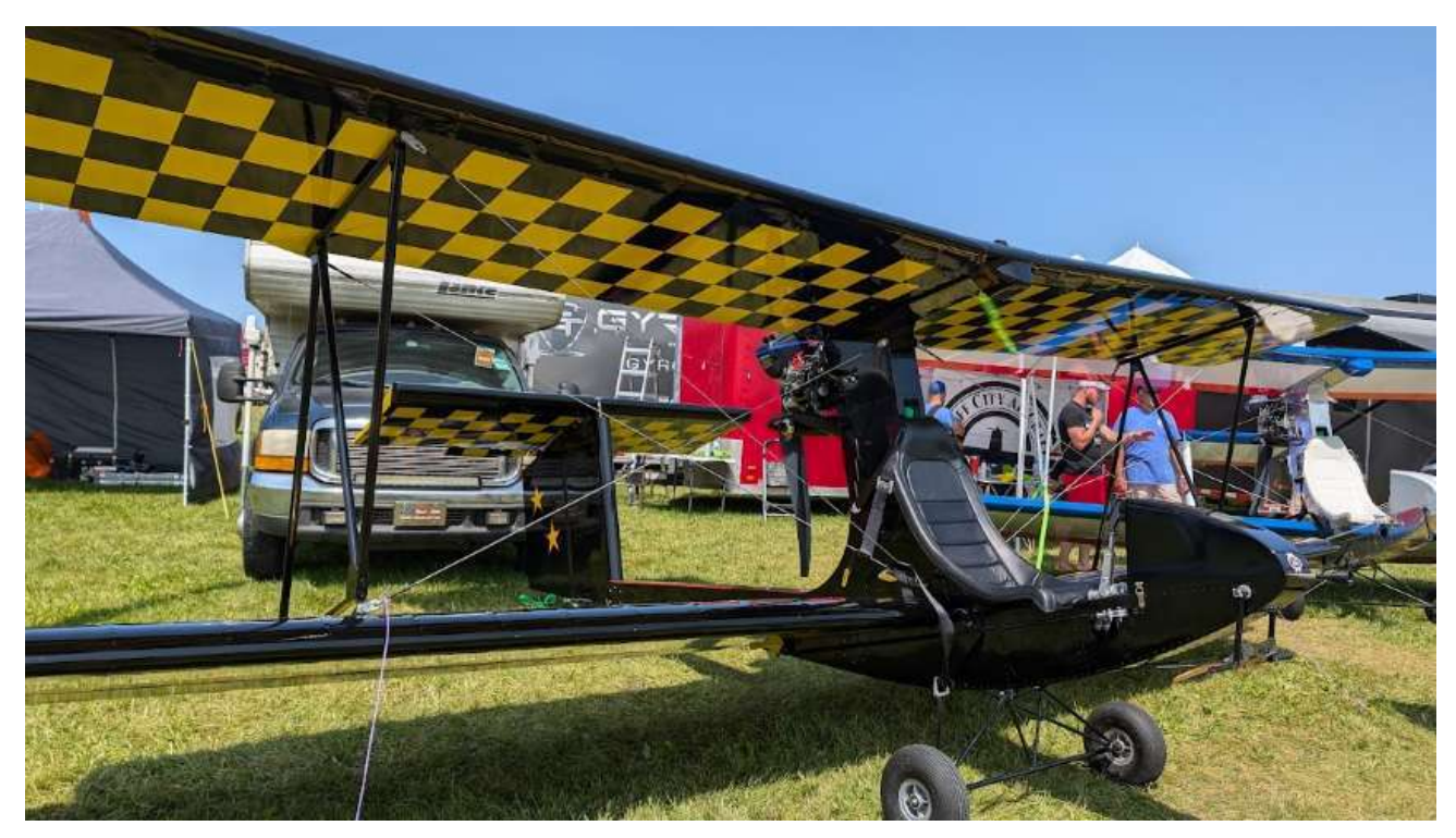
The Dingo from "Future Vehicles" in the Czech Republic. <a href="https://www.futurevehicles.eu/dingo-en/">https://www.futurevehicles.eu/dingo-en/</a>