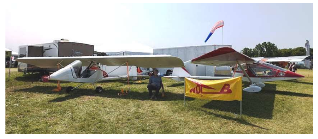
The Kolb Trifecta; Firefly, Firefly, and the Twinstar Mark III <a href="https://kolbaircraft.com/">https://kolbaircraft.com/</a>