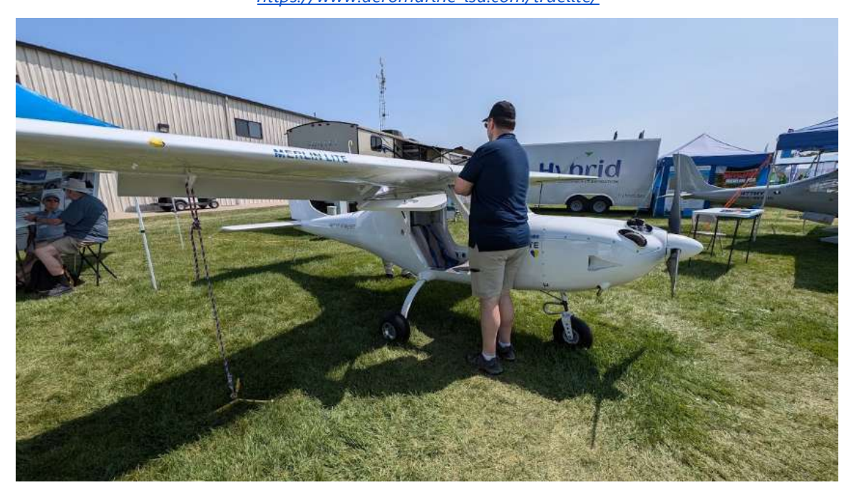
Merlin Lite Ultralight and Motor Glider from Aeromarine-LSA.com <a href="https://www.aeromarine-lsa.com/wp-content/uploads/2022/03/750-Floats-and-Merlin-Lite.pdf">https://www.aeromarine-lsa.com/wp-content/uploads/2022/03/750-Floats-and-Merlin-Lite.pdf</a>