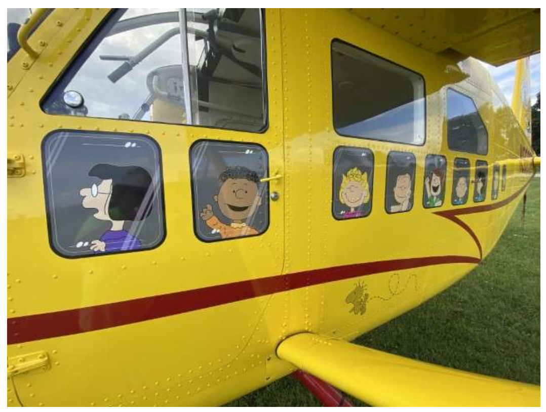
Aermacchi AL-60 N96038