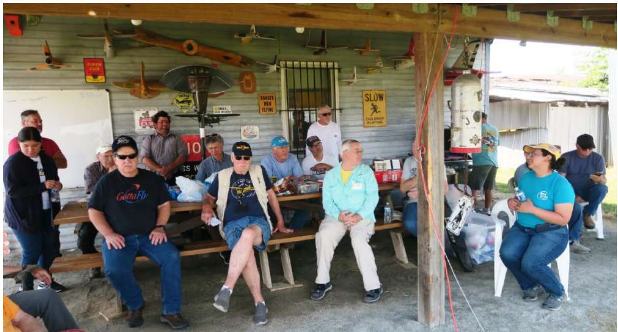
The June club meeting at Maples