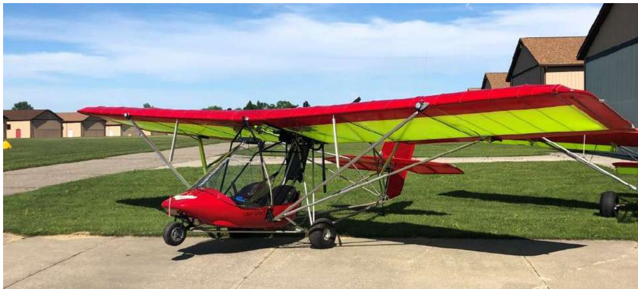
M-Squared Breese belonging to the Michigan Ultralight Flying Club

he's being trained in his own airplane. But for an instructor to take money for teaching someone who does not own the airplane, the plane may not be an Experimental, neither ELSA nor E-AB. Hence, an SLSA. And the instructor must be an FAA Certified Flight Instructor.