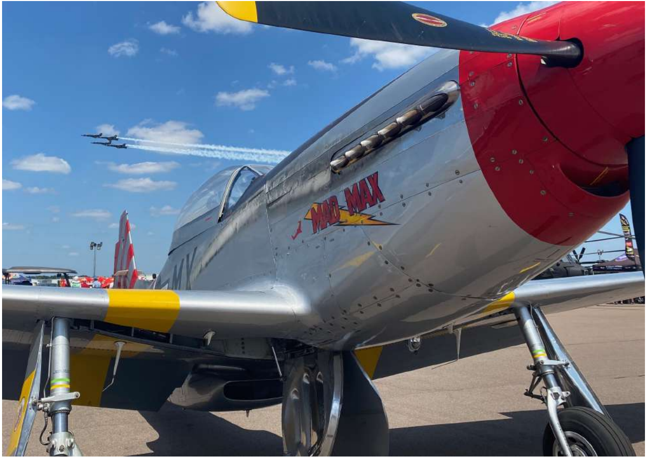
A Mustang and the Blue Angels