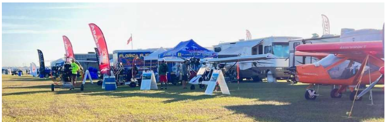
Light Sport Aircraft Lineup