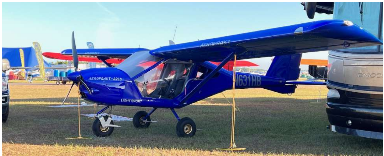
Ukrainian Aeroprakt A22LS Light Sport Aircraft