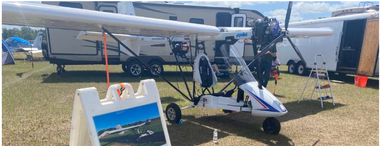
DAR Solo UL Part 103 Ultralight