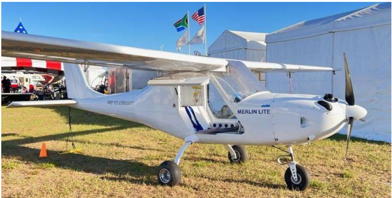
Aeromarine LSA's Merlin Lite, a Part 103 Ultralight