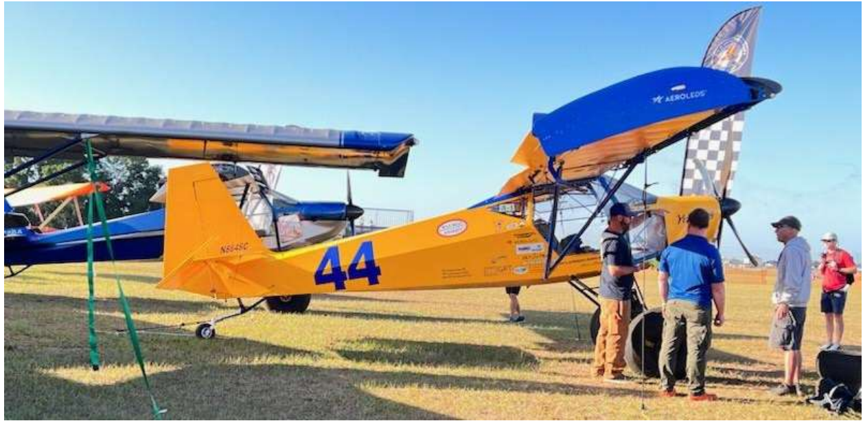
Just Aircraft Highlander