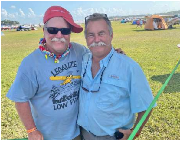
Photographer Tim Loehrke, left...we think