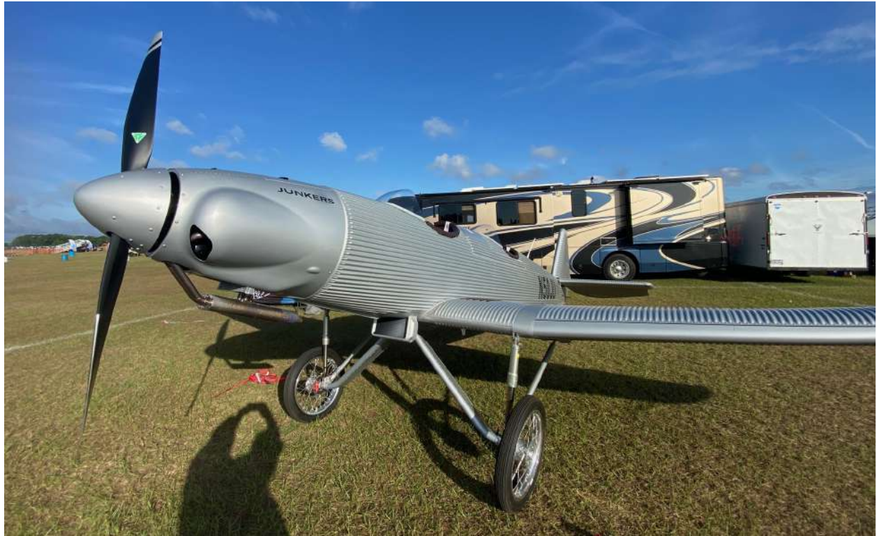
Junkers A50 Junior LSA