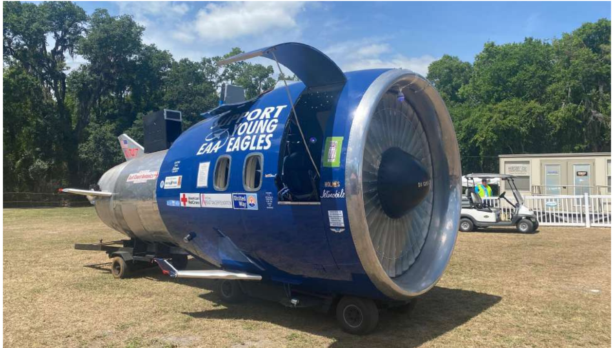
Young Eagles Jetmobile