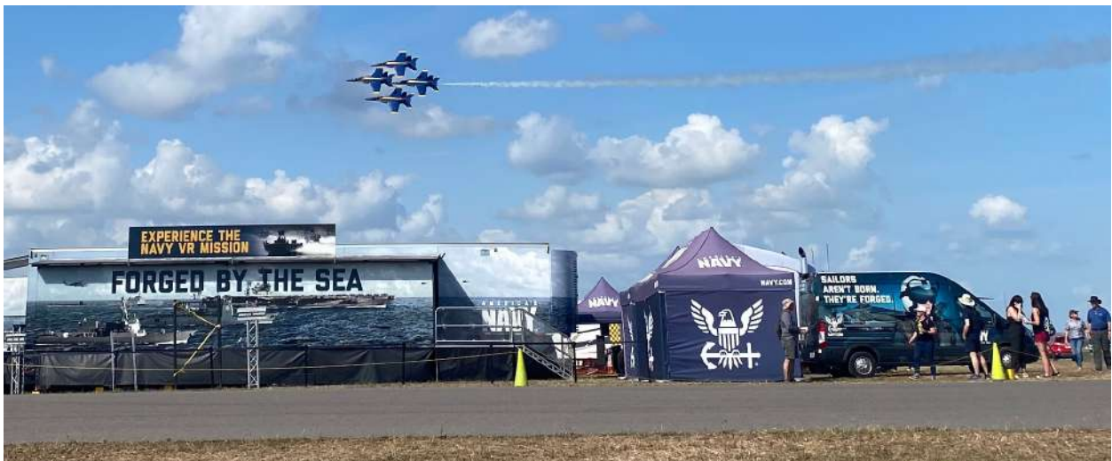
The Blue Angels