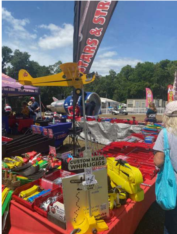
Custom Whirligigs by Loehrke