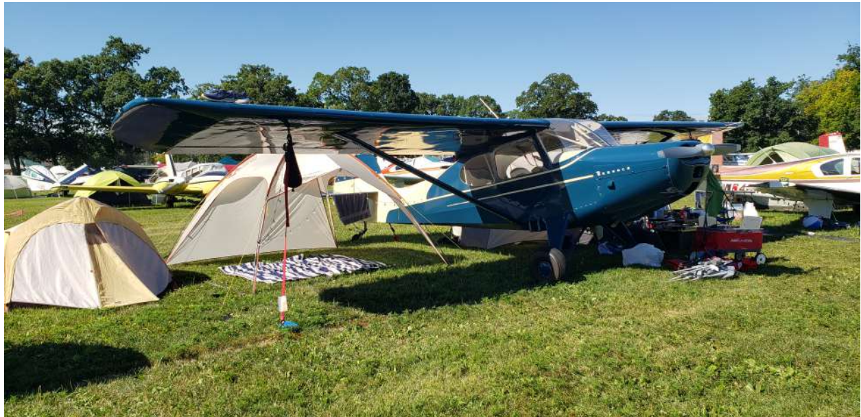
A beautiful Aeronca Sedan with an enviable campground setup

The Vintage area is near and dear to my heart so when I had some free time, I wandered around there. Part of what took up my time at Oshkosh was helping out in the Vintage hangar at the Aeronca Aviators and Bellanca Champion Clubs in the afternoons, so on my wanderings, I took many pictures of Aeroncas, Bellancas, and a couple Champions (though many are too new for Vintage).