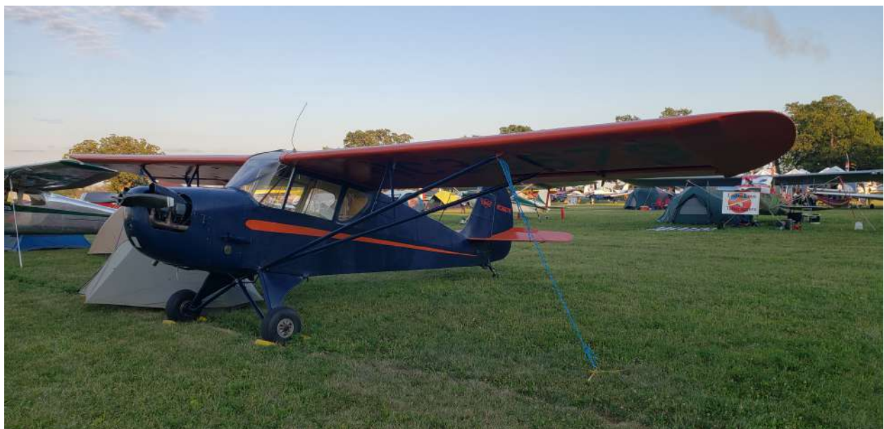
Aeronca 65-TAL on its way to its new home in Montana

I even made some new friends in a young couple who just purchased an Aeronca 65-TAL in Maine and were on their way home to Montana when they had to divert towards Oshkosh for weather and decided to stop in and see what it is all about! Talk about an adventure!