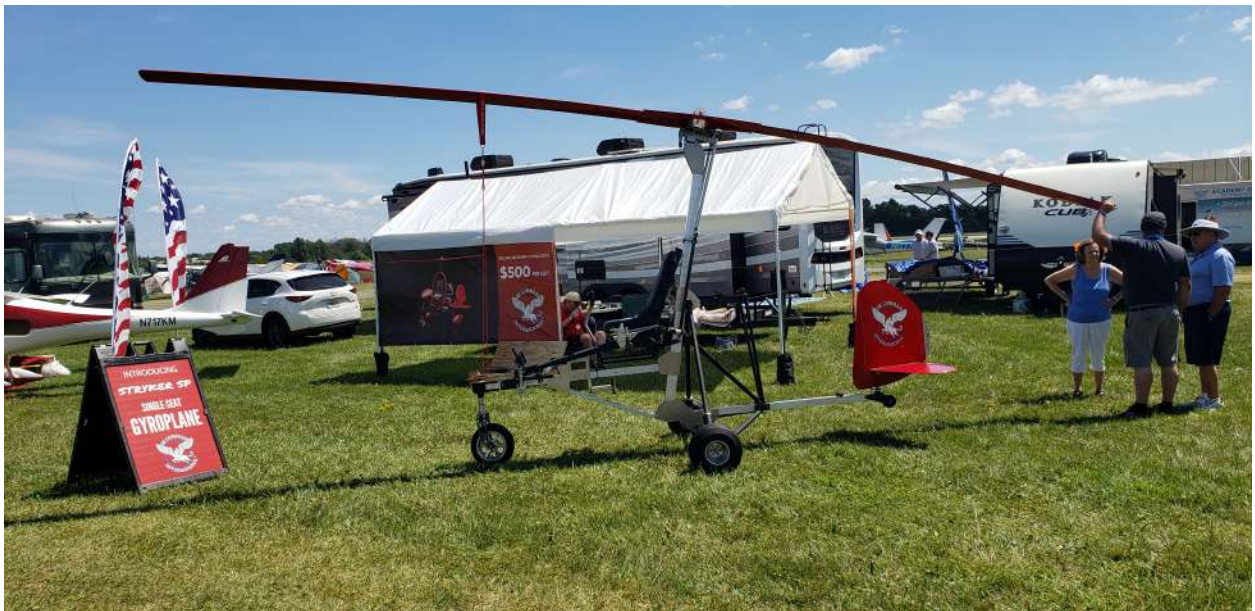
Stryker SP single seat gyroplane

Rotorcraft seemed to be very popular this year.