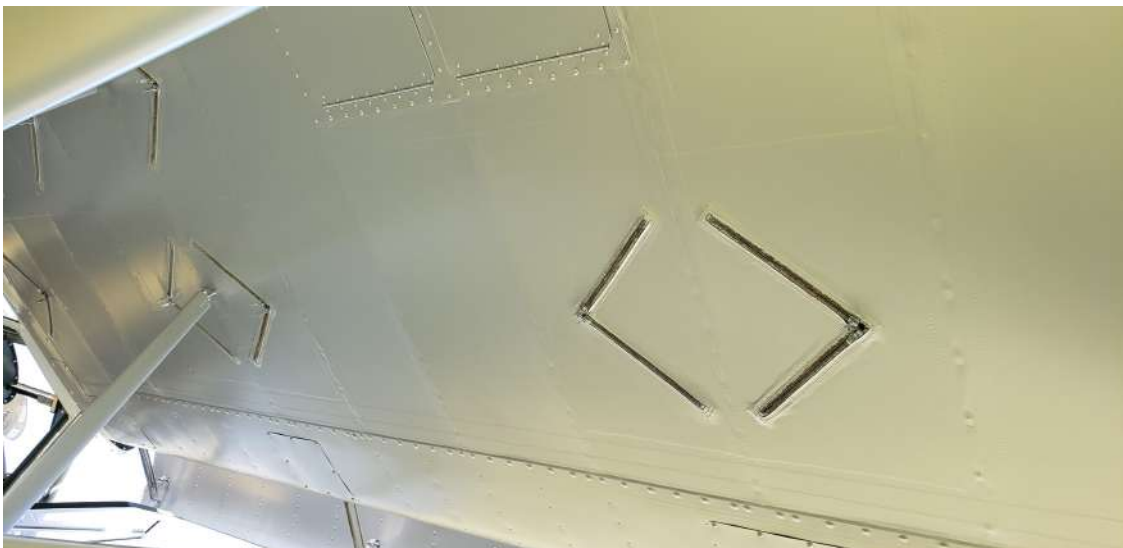
Underside of the L-5's wing with zippers

First, a bit about that L-1 on the right: it is HUGE! It dwarfed just about all of the other L-birds. What I found most interesting about it though are the zippers on the underside of the wing in place of inspection covers. I had a chance to speak with the owner briefly and he said it seems like a really great idea...until you go to use them. Then you are trying to carefully bend the fabric without cracking the paint while sticking your arm up in a hole with metal zipper teeth on the edge chewing it up.