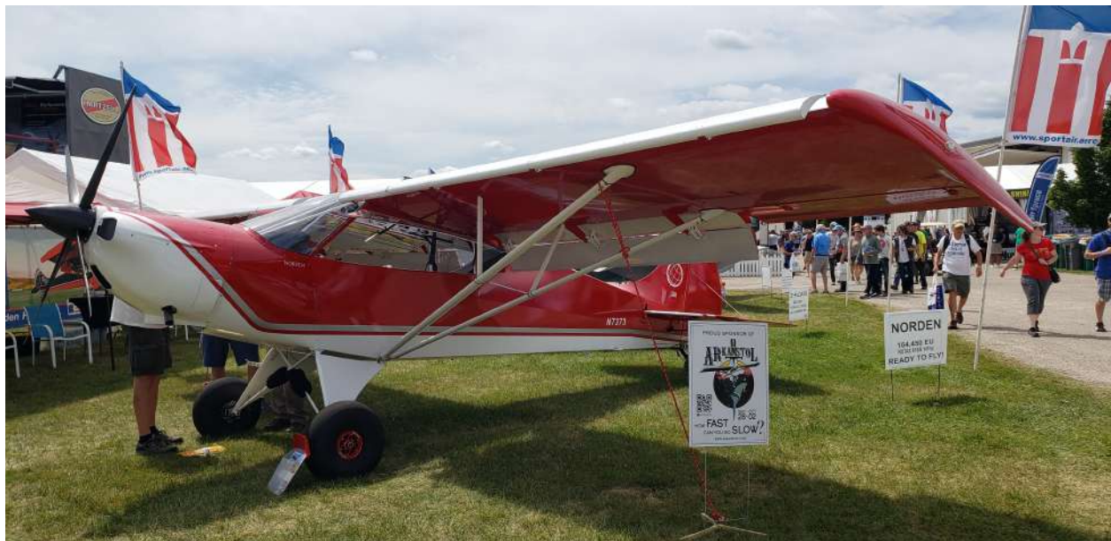
Savage Norden (definitely not an ultralight)

I did get time to go to a type club forum for Aeroncas, and to do something I've been wanting to do for a long time - a Stewarts System fabric covering workshop. It was a great workshop with plenty of hands-on experience (almost 5 hours of it)! And better yet, I got to take it with my new friends with the Aeronca 65-TAL.