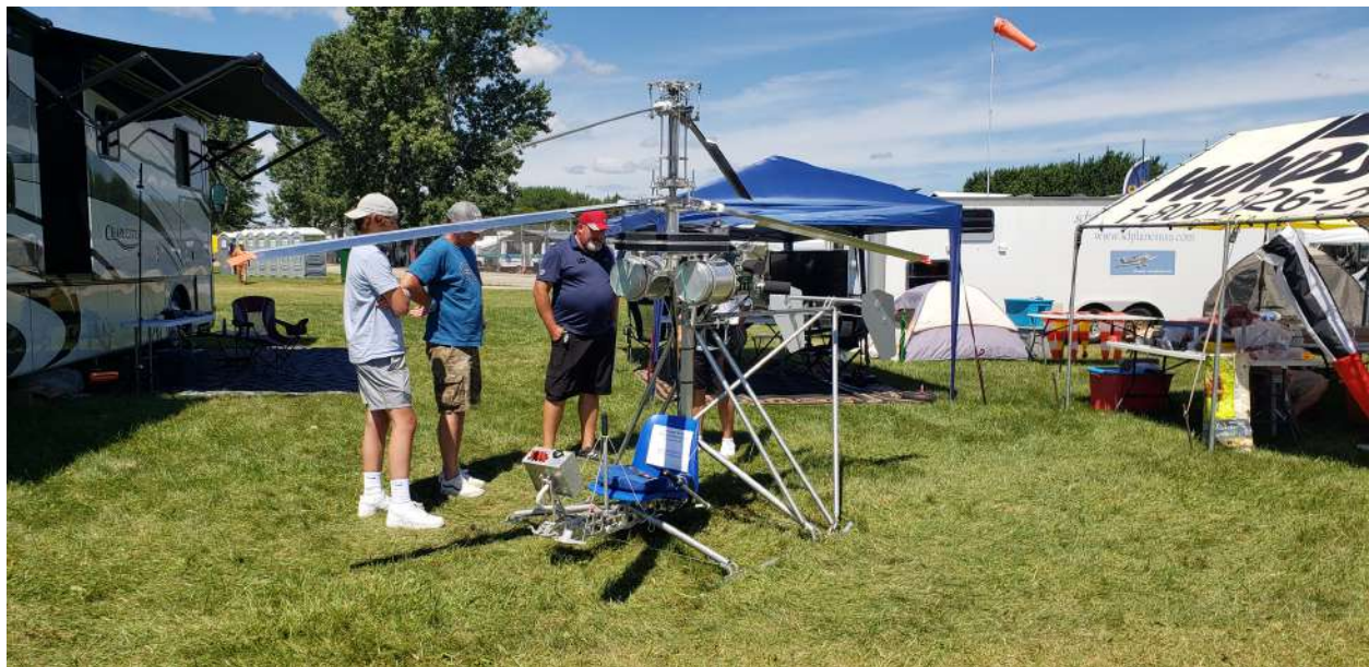
Microcopter SCH-2A - part 103 coaxial helicopter

Bushplanes were also popular. I was surprised to see a new folding-wing ultralight bushplane that I had never heard of before - the Badland. Well, as it turns out, this is the former Belite part 103 aircraft, which I found out while writing this was formerly the Kitfox Lite. bydanjohnson.com gives more information on the aircraft and its history.