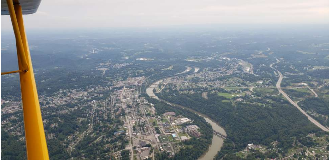
Climbing out from CKB at the start of the last leg of my trip home

When I woke up in the morning and looked out the window, I wished I had pushed on in the dark. It was dreary. A check of the weather showed areas of low ceilings and rain. I had a leisurely breakfast at the hotel and then caught their shuttle to the airport. The weather wasn't great, but I saw that by deviating to the north, I could get around the lowest ceilings and highest terrain and make it safely over the mountains. After 2 hours of dodging stray clouds and a few rain showers, I made it safely back to Culpeper, VA (CJR). What an adventure! Total time was 12.5 hours there and 9.2 hours back of flawless performance from my trusty Rudy. And I would do it again!