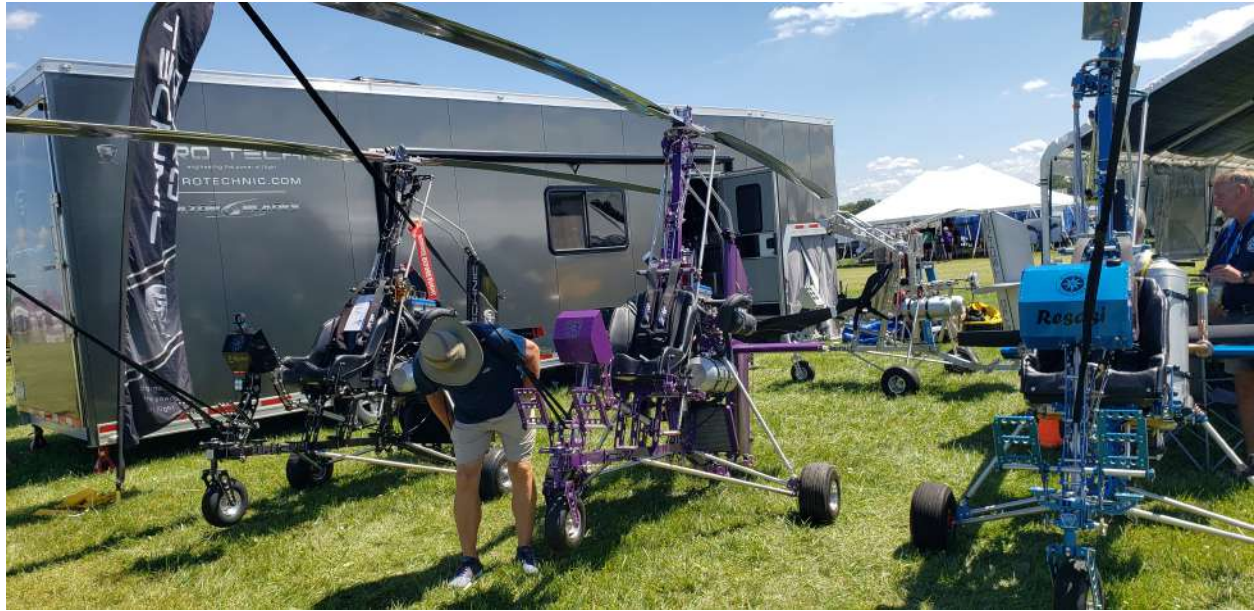
The Gyro Technic lineup