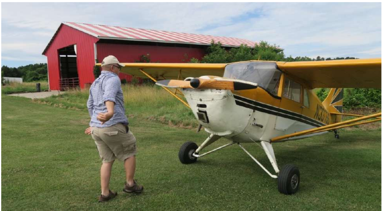
Aeronca Chief being hand-propped at Rhynalds