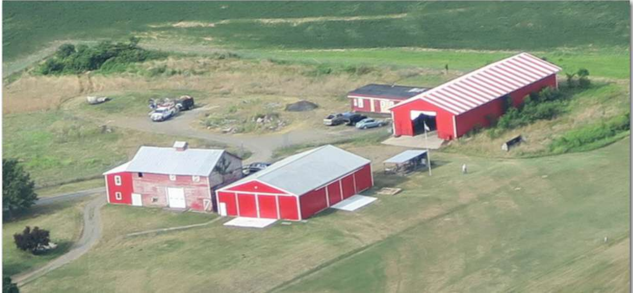
Hangar at Rhynalds

few more years while her daughter is in high school. She would like to rent out space in the large hangar you see in the foreground below. She's asking $300/month for a 1-airplane share of the hangar. There would be other peoples' things in the hangar; you would not be renting the entire building. You would need liability insurance. If you're interested, give her a call at 540-272-4575.