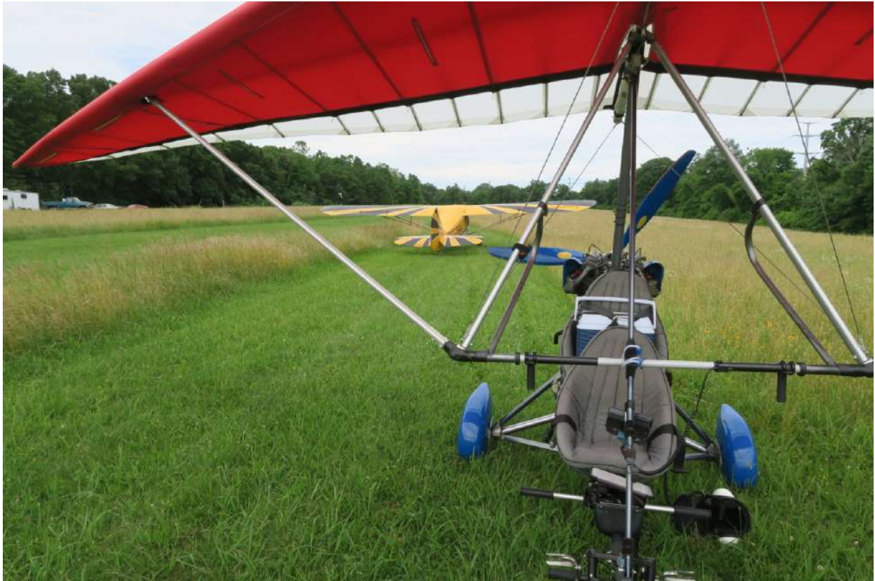
Trike and airplane at AviAcre