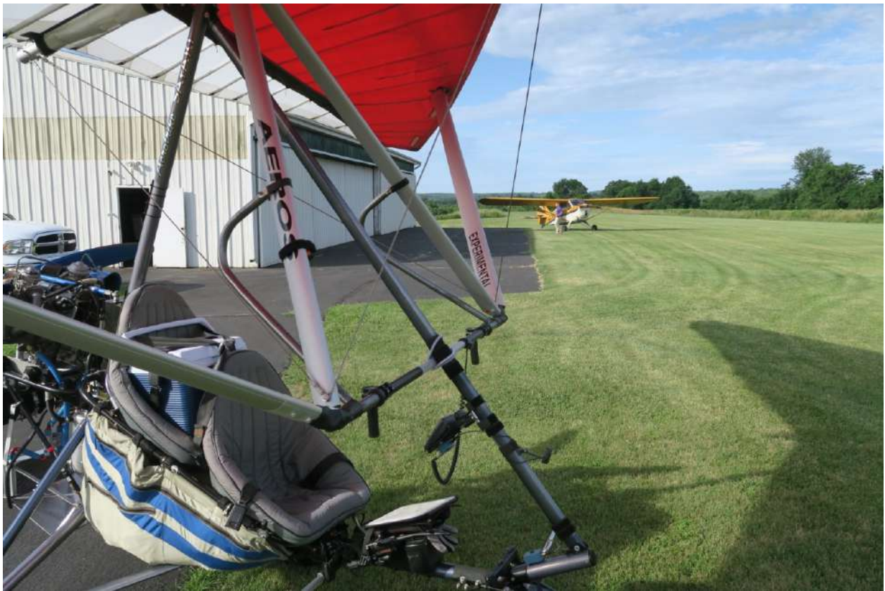
Trike, hangar, and Aeronca Chief at Fox Acres