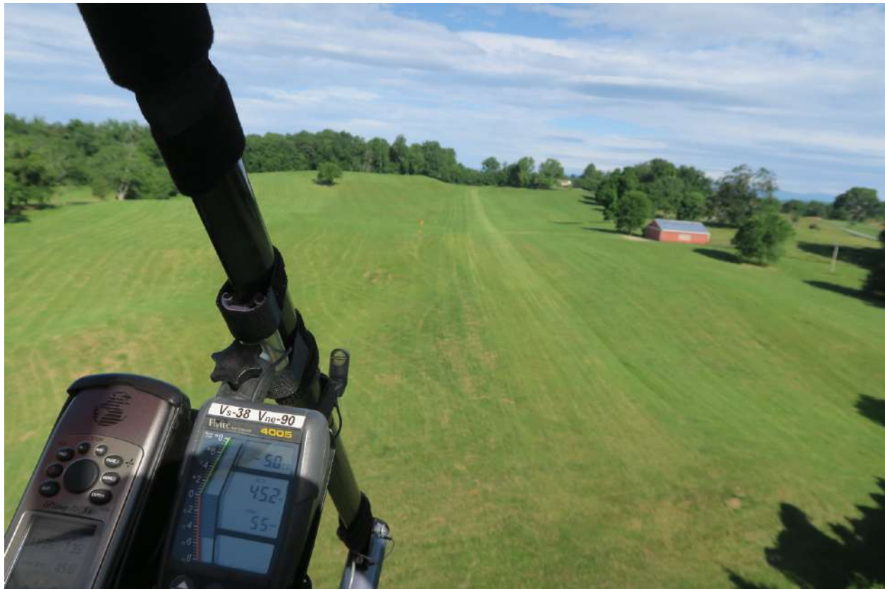
The runway at Pleasantdale, looking west

Now, by calling Pleasantdale a roller-coaster , I may have overstated the case. Monty chose not to land, but I had no trouble at all. Look at the pictures and see for yourself.