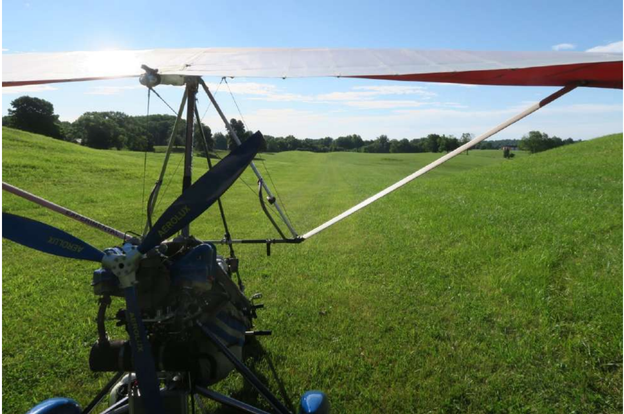
Ready for takeoff at Pleasantdale, looking east

Lenn Bros. I got a surprise coming into Lenn Bros. – a doe and two fawns on the runway. Fortunately, I saw them before I had committed to land, so I was able to land long over them.