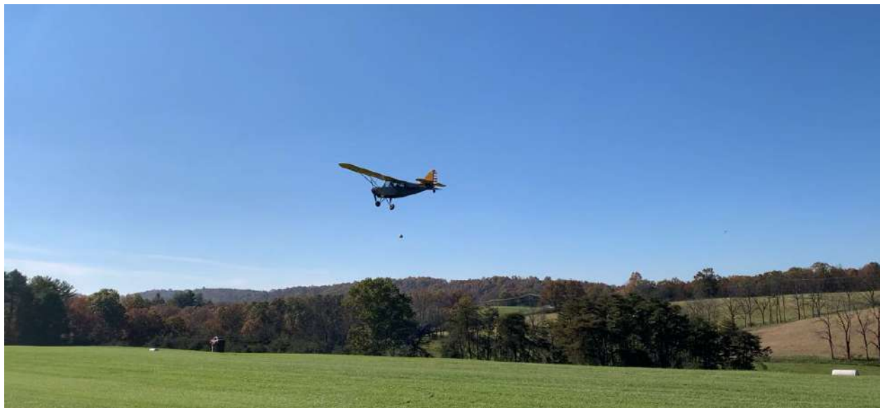
One of our bombing runs.

We made four passes to drop our four pumpkins. Though we got close on a couple of them, we did not hit the target. Due to the cold wind blowing in the back of the aircraft, mom declined to re-arm and go for a couple more passes, but she had a lot of fun! We spent the rest of our time there watching the other participants and drinking hot beverages.