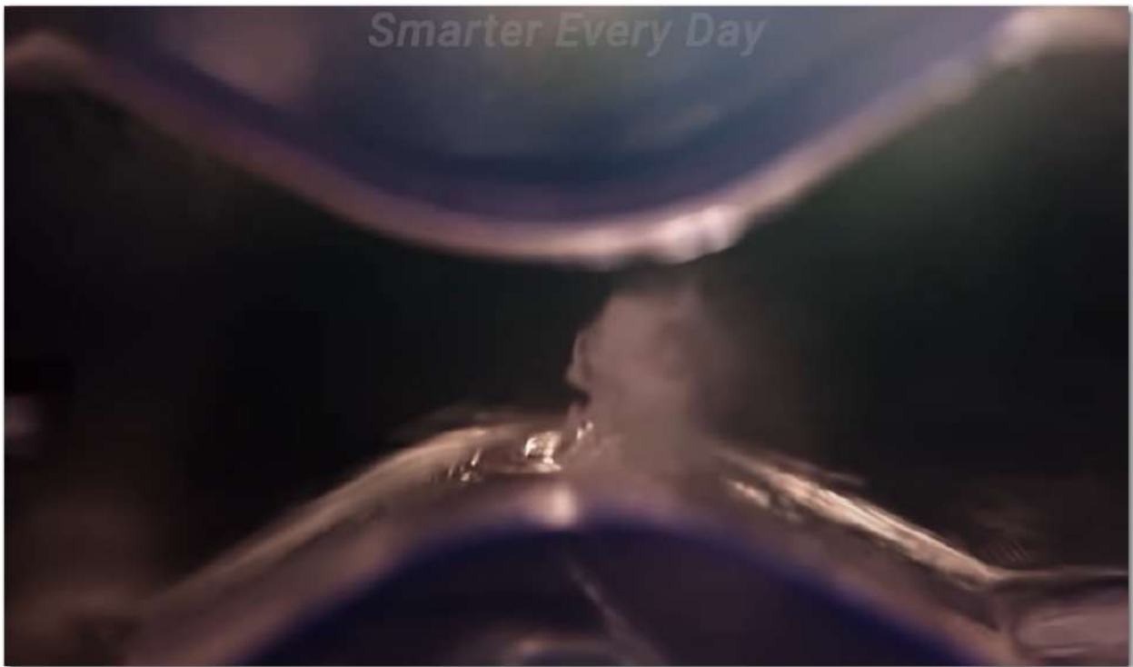
and being vaporized and swept to the right by the intake stroke