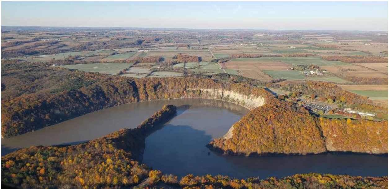
The Hogsback in Letchworth State Park

I set off early in the morning with my mom. Rudolph was nice and warm in the hangar and started right up. I guess he was eager to go too! We were making good time and the air was perfectly still so I decided we had time for a bit of a detour. I flew mom over Letchworth State Park - “The Grand Canyon of the East” with a gorge and an impressive series of waterfalls on the Genesee River. Unfortunately, due to the early hour, the inside of the gorge and the waterfalls were still in shadow. Mom got a big kick out of it anyway.