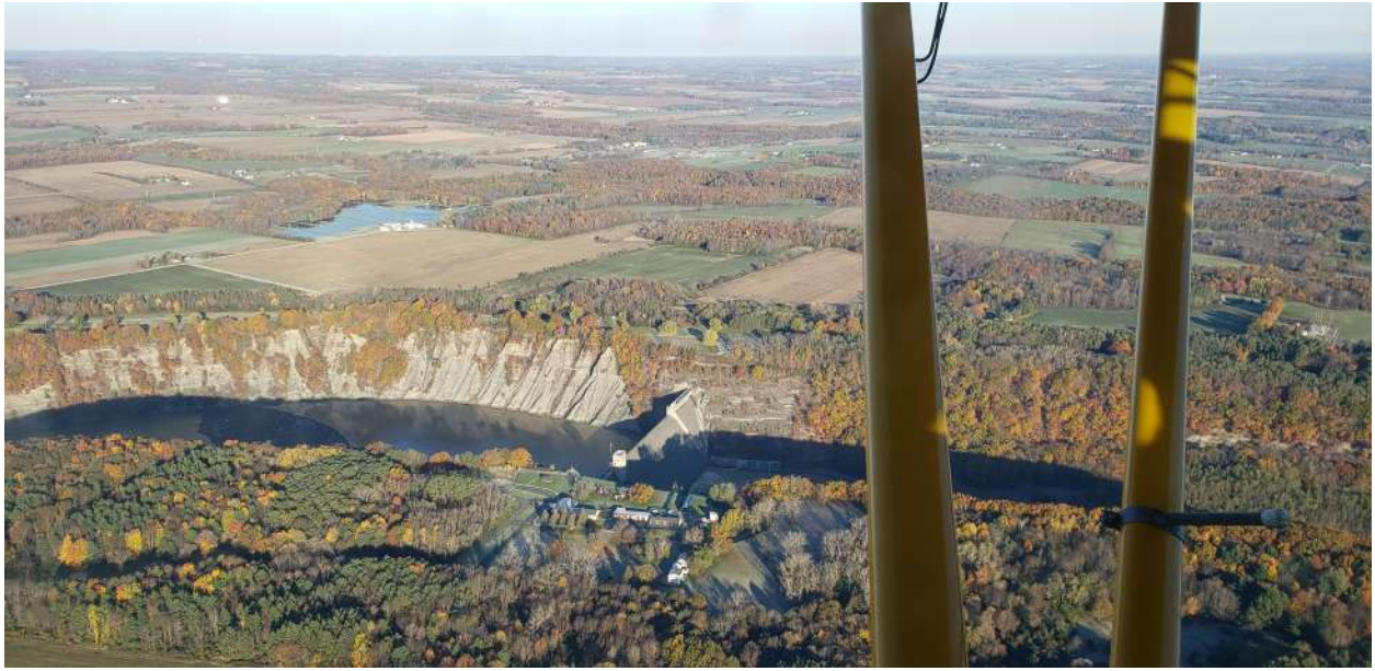
Mount Morris Dam in Letchworth State Park