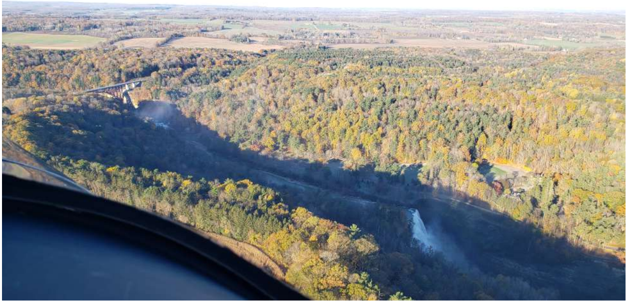
Middle Falls with the Train Trestle and Mist over Upper Falls in Letchworth State Park