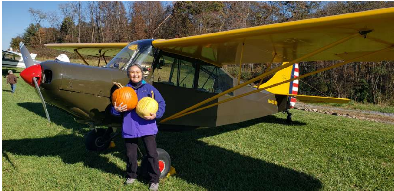
My mother/bombardier with two of the pumpkin bombs

We made four passes to drop our four pumpkins. Though we got close on a couple of them, we did not hit the target. Due to the cold wind blowing in the back of the aircraft, mom declined to re-arm and go for a couple more passes, but she had a lot of fun! We spent the rest of our time there watching the other participants and drinking hot beverages.