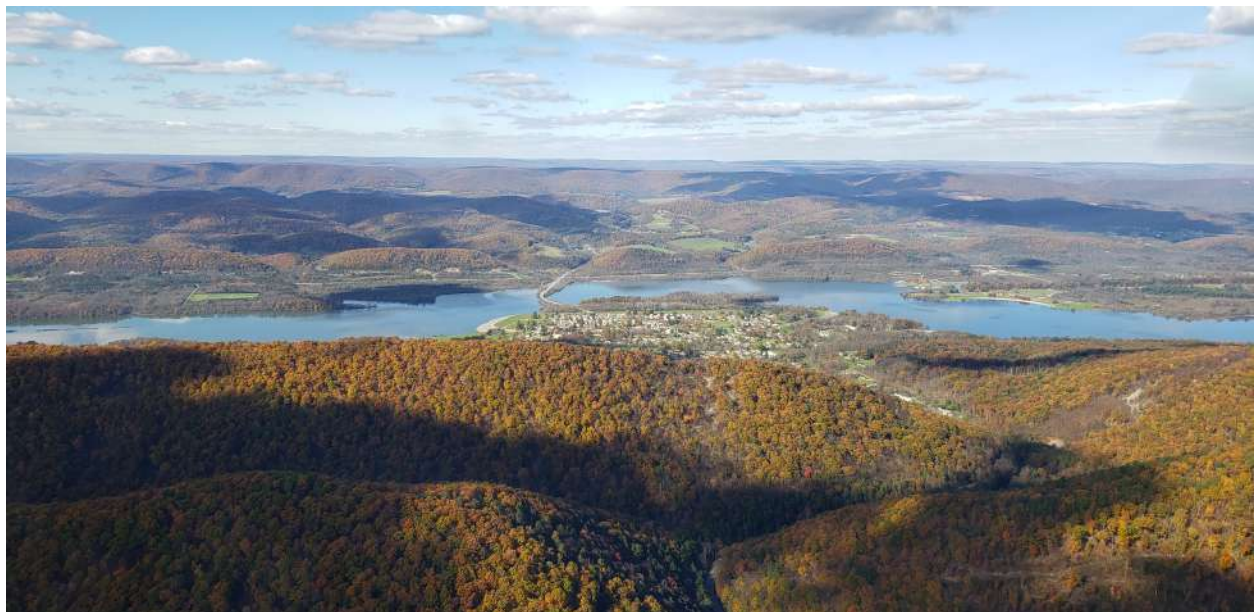
Near KRVL in Pennsylvania

The first weekend in November promised to be absolutely gorgeous with clear skies, mild temperatures and no wind. Thanks to vacations getting canceled due to COVID, I had plenty of vacation time so I decided to take a couple days off and enjoy the weather. My mom had been wanting to come down to meet her “grandhorse” AND there was a pumpkin drop at Greater Breezewood (P17) up in Pennsylvania. A plan started to form in my mind that would allow me to also share this wonderful aviation lifestyle with my mother, who has been rather skeptical about airplanes being any fun beyond shortening travel times. The key to this is that despite what it sounds like, my mom can be quite fun and pumpkin bombing is right up her alley.