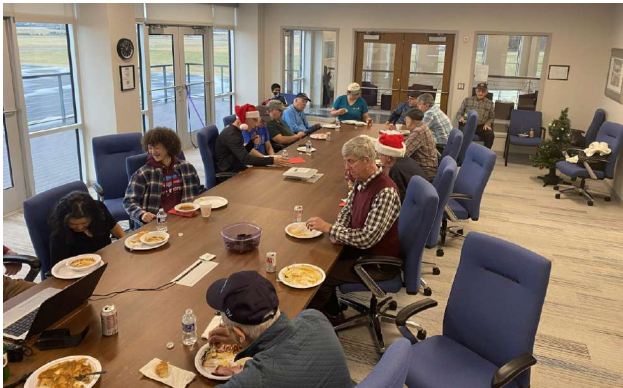
2021 Holiday Party at KHWY