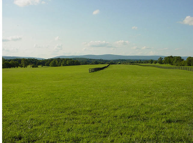
Runway 34, 2,700 feet

The property was formerly known as Flint Hill Farms and comprised 856 acres, of which the airport was a small part. Mr. Harris died in 2000, or so, and the property had been on the market for a few years when developers bought it in 2005. Their timing was not good, as the recession arrived soon after. They have sold only about half the property, which is why the prices have been reduced. The airport is in Lot #2, 100 acres, reduced from $2.12 million to $1.8 million.