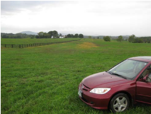
Runway 30, 1,600 feet

Care to buy an airport? The former Harris Field is for sale in far northwest Fauquier County. It has two grass runways on high ground clear of trees with good approaches. Beautiful views of the Blue Ridge—50 minutes from the Beltway. The asking is $1.8 million, but make an offer!