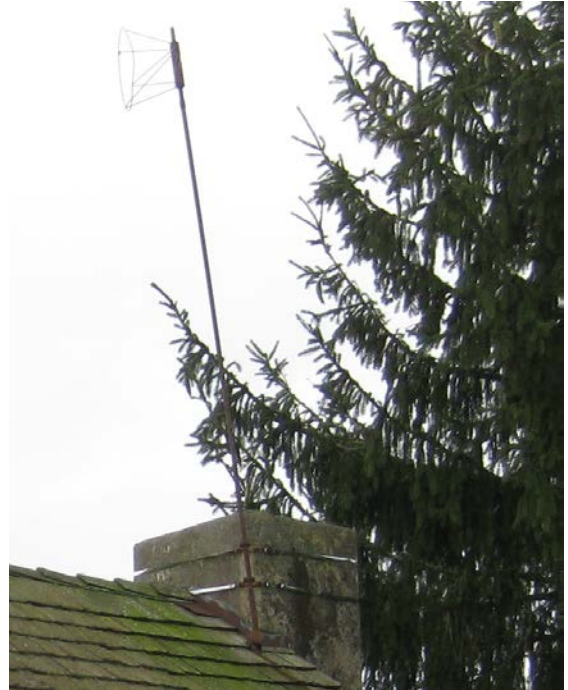
Remains of the wind sock

See the airfield in Google Maps at http://goo.gl/Mhfr0 . The coordinates are 38.912558, -77.881651