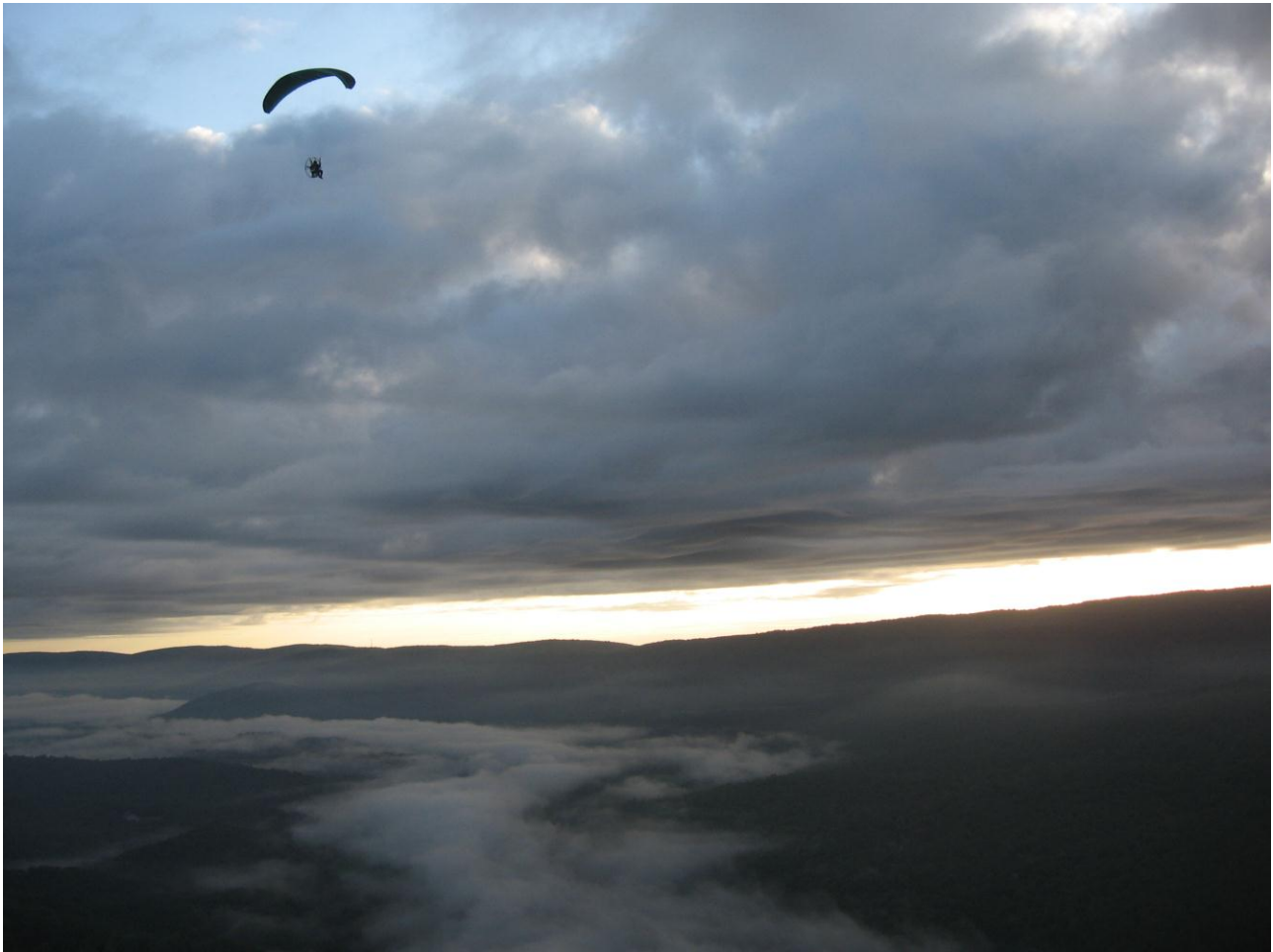
Shortly after takeoff from Pickles Field (Berryville, VA).