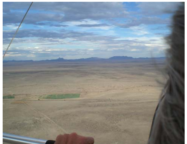
The Davis Mountains