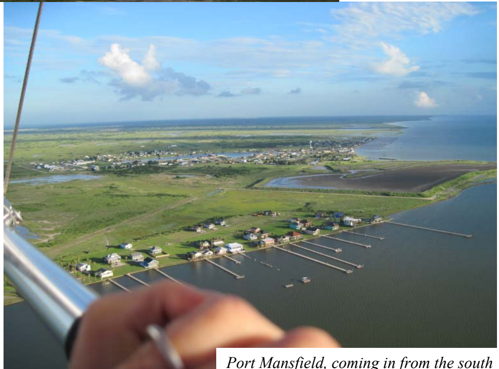
Port Mansfield, coming in from the south

Linda and I have flown south to the border region in order to see South Padre Island and Port Isabel from the air, flying up pristine beaches and passing luxury hotels where kite surfers flitted around madly below us. From 500 feet, one can see the ocean traffic coming into the Port of Brownsville channel. One morning we buzzed a massive offshore oil rig coming in from the natural gas fields out the Gulf.