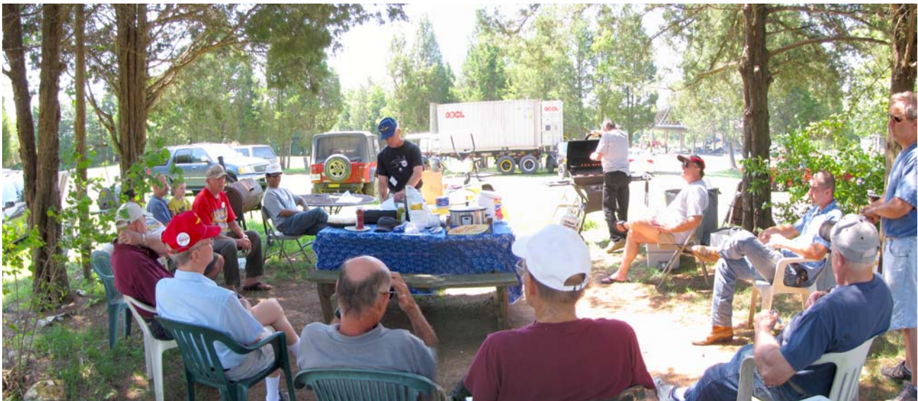
June Club Meeting