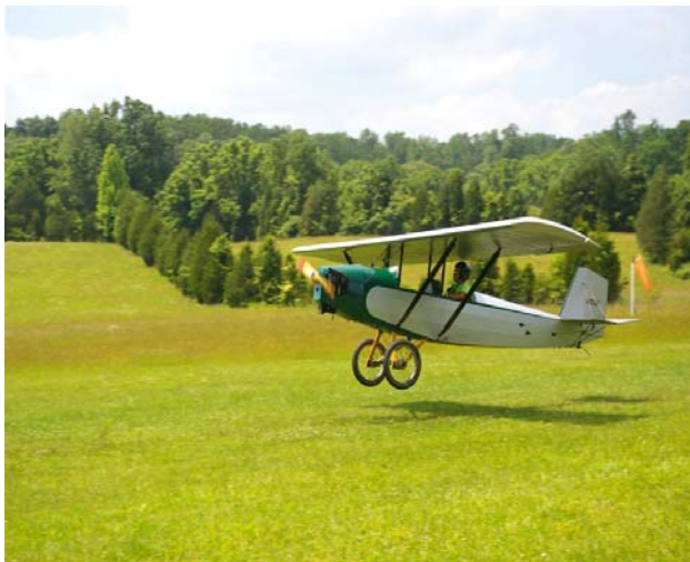
Landing