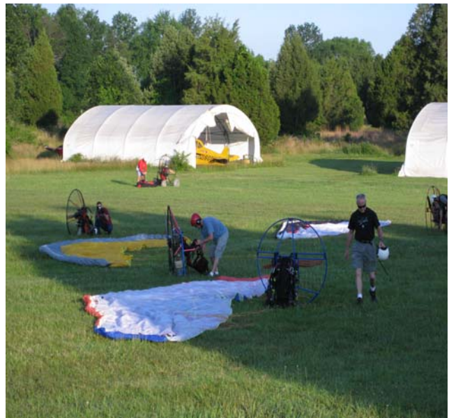
Our 5 PPG Poker Run Contestants

The fixed wing crowd had a challenging series of airfields to fly. All returned happy from somewhat bumpy flights and difficult landings.