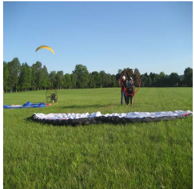
Relaunching From Tharpe Field