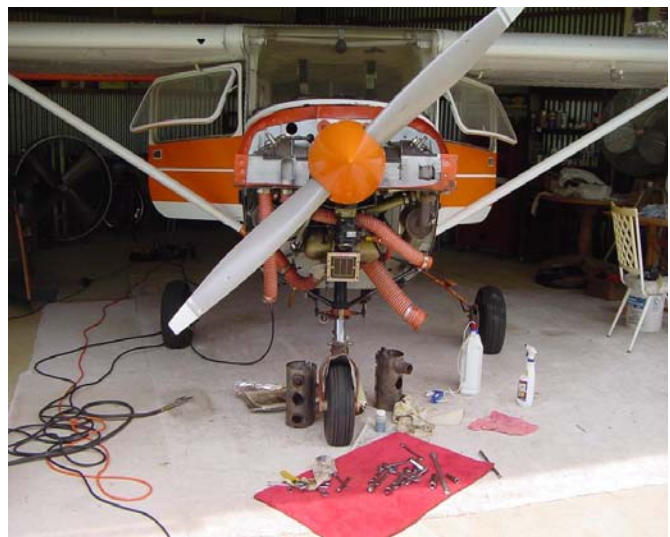
Under Construction