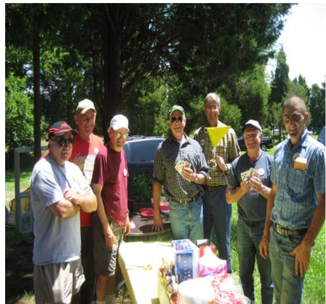
Would You Play With Any of These Guys?