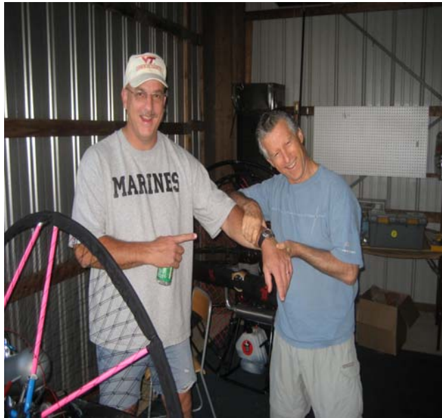
Very Early Start

The powered paraglider contingent was out early. Very early for some. Into the air a little before seven A.M. a group of five set off for the day's objectives. A good time was had by all although the windy conditions did mandate some alterations of the planned route.