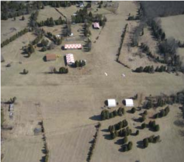
Laying Out for Takeoff Flight -- WAP

Flight instructors. While our club does not officially endorse any individual flight instructors we are now fortunate to have both fixed wing and powered paraglider instructors available in our area. If you have friends looking to fly these folks could be a valuable resource.