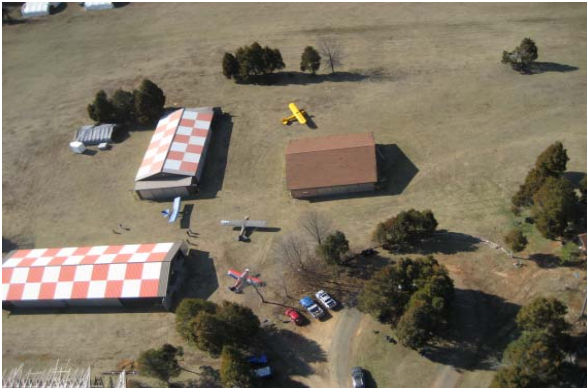
Traffic on the Ramp at WAP, March 2008

Happy Spring. Hope your flying this season will be enjoyable and safe.