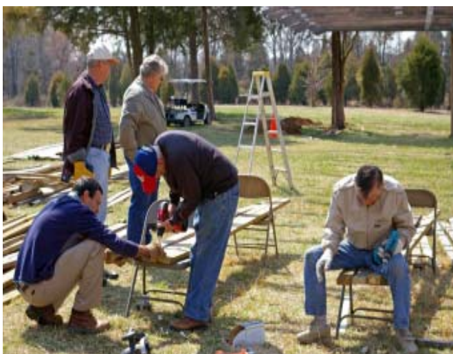
Work Party