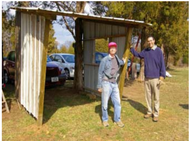
Cart Shed

Still plenty of work left to do and will stay in touch as we move forward.