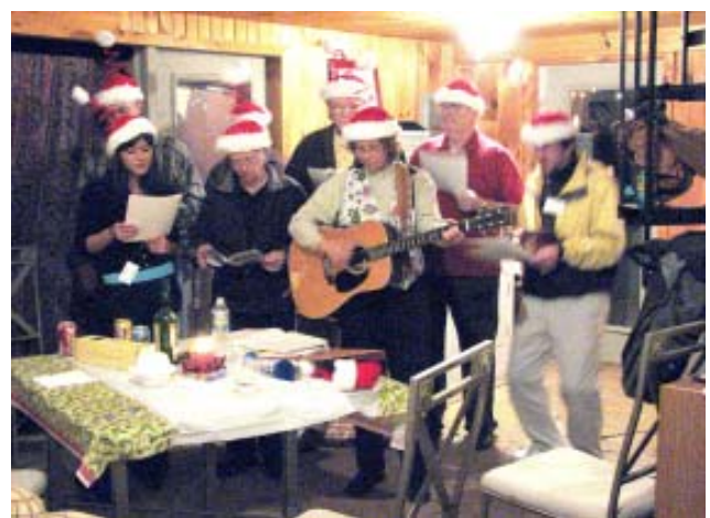
The Rotax Tabernacle Choir presenting its 2006 Holiday Program