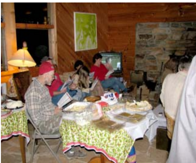
Members and Guests singing along with the Choir.