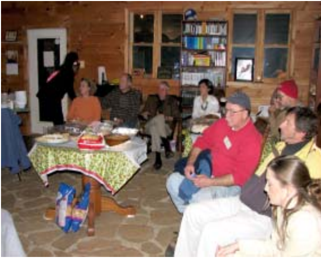
Club 1 Members and Guests during the meeting