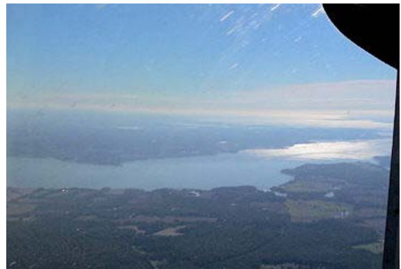
A view down the Potomac River with the Chesapeake Bay beyond,

We flew down past the Quantico restricted area toward Stafford airport., turning more to the east as we followed the edge of the ADIZ, staying about 2 miles outside. We were threading a number of needles between the restricted areas covering Quantico, Dahlgren, Patuxent River NAS, and Dover, part of which meant passing through a gap about 1/2 mile wide between the ADIZ and the Dahlgren restricted zone that coincides with the location of the 301 bridge across the Potomac River. Here, it is just possible to navigate a plane through the tiny gap in the airspace and save diverting about 30 miles to the south. The trick is not to miss the hole, and to stay over the bridge. A small navigational error could put you in a world of hurt, with Dahlgren’s guns to the south, and Quantico’s Blackhawk gun ships to the north.