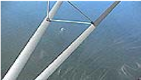
Tankers are not so big from 3000 feet.

The flight across the bay was spectacular. We crossed at a point along the bay north of Patuxent River NAS, making landfall near Easton, Maryland, where the bay is only about 12 miles wide. But, even at 3,000 feet, it still looks like really BIG water. As we broke the eastern shoreline, it was difficult to see the horizon ahead, as the water and the sky blended into a huge monolithic blue wall. Without a reliable horizon, we flew by compass heading, altimeter, and rate of climb indications, until the opposite shore slowly emerged from obscurity in the distance. Looking to the south, we could see the late morning sun shining off the water in a shimmering light display. Directly below us, ships, pleasure boats and even a schooner under full sail plied the water of the Chesapeake.