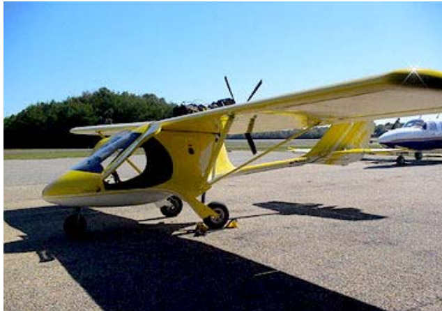
A beautiful Sky Boy airplane. The latest member of the growing fleet of Experimental Light Sport Aircraft.