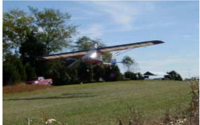
Club 1 Fall Fly-in, Lenn Brothers Field, October 2000