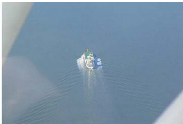
The Bay was full of tanker traffic.

After lunch, we set out for home, basically back-flying the same route. The return trip was by no means anticlimactic. The trip home was at least as good as the trip up. As we flew, we were treated to a repeat of the signs that had made the morning so special.