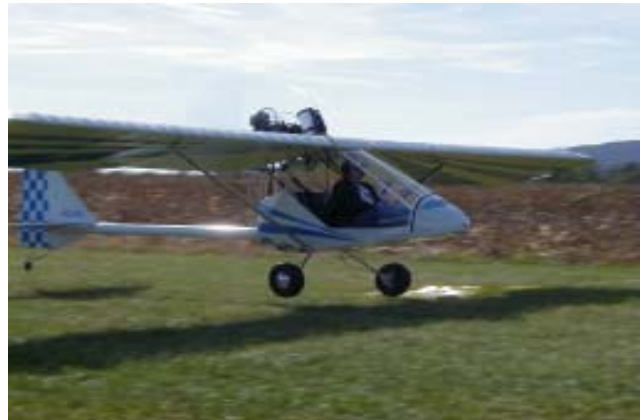
Spot Landing at lenn Brothers, October 2000