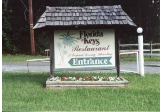
Sign at the entrance to Footlight Ranch, advertising the Florida Keys Restaurant, a favorite of all who have eaten there.