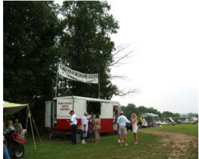
Flight Line Snack Bar

I have attended all but the first few of these events. Each year, I leave thinking about the fine, fun time I've had and looking forward to next year. Try it, you'll like it - and bring your family!