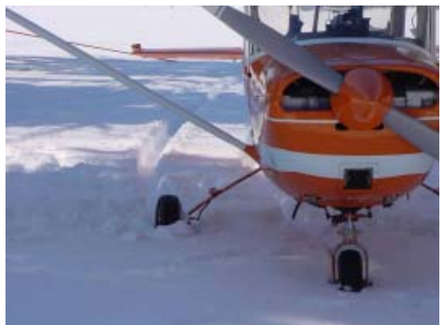
This is why I had to taxi at full power!