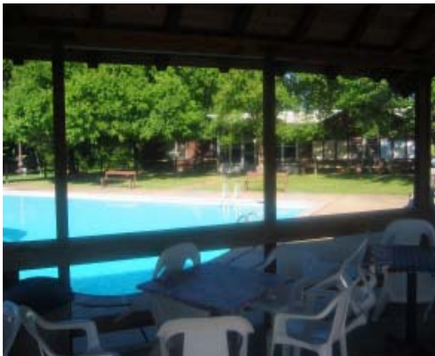
Looking across the pool toward the restaurant at Footlight Ranch