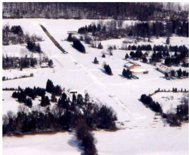
Hold your breath - maybe it won't go away!