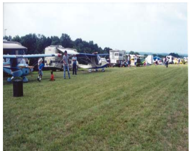
Looking west along the flight line at Shreveport North