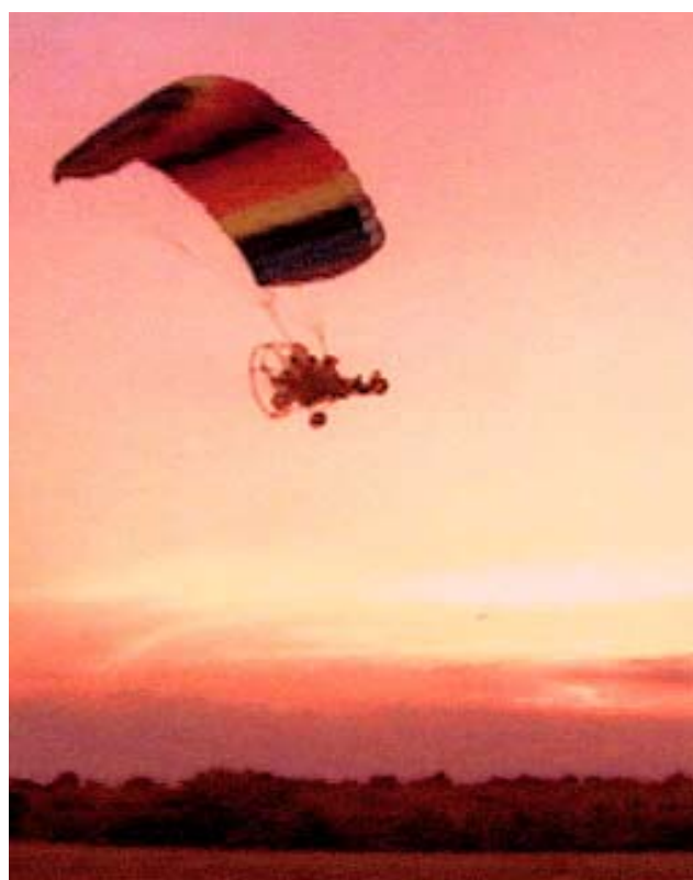
Sunset at Footlight Ranch