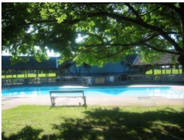
Looking back across the pool from the restaurant toward the bandstand