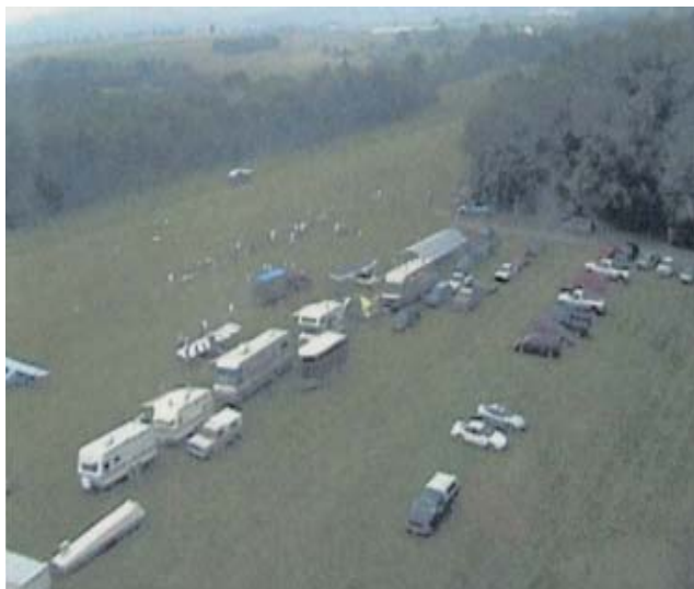
Flight Line at Shreveport North from the air.