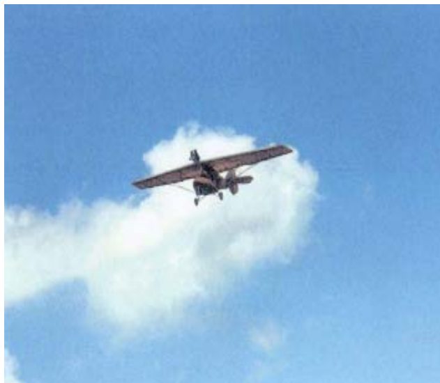
On final to 23, Shreveport North

Items bought and sold through the Newsletter are solely at the risk of the buyer and seller. Neither the Newsletter nor USUA Flying Club 1 guarantees, or is in any way responsible for, the airworthiness or other aspects of the items listed.