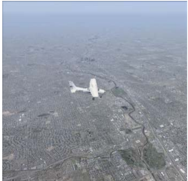
Denver, Colorado. Its downtown with its tall buildings can be seen just over the plane’s left wing.

Preview screenshots can be seen at www.megascenery.com . I’m including one shot copied from that web site that gives you an idea of just how real it can be.