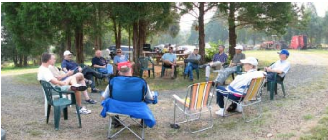
September Meeting of Flying Club 1 Warrenton Air Park