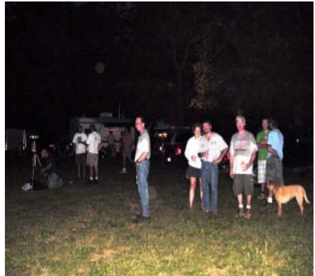
Folks Having Fun!