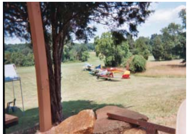
Warrenton Air Park after a Poker Run